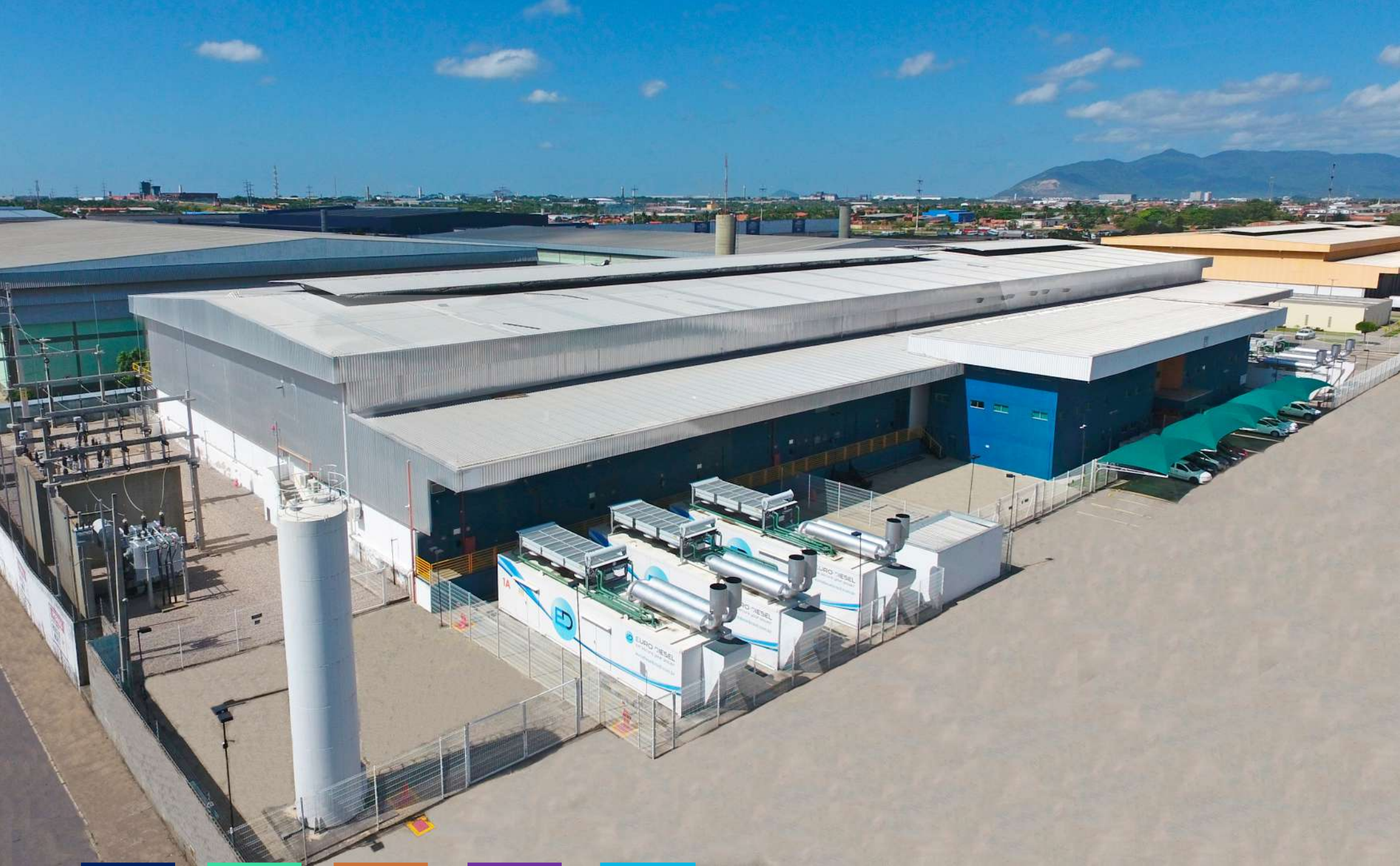
Data Center Fortaleza 1