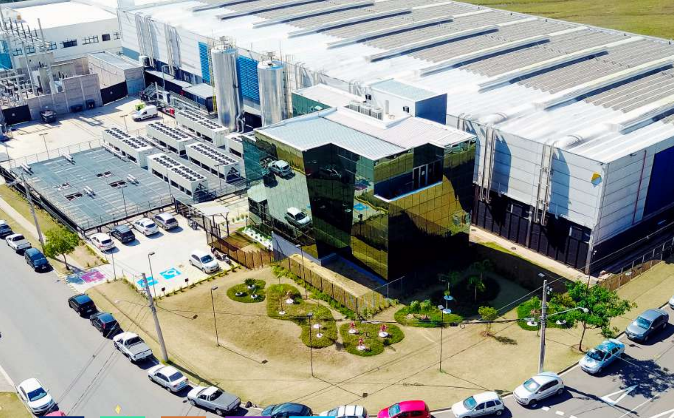
Data Center Jundiaí 1