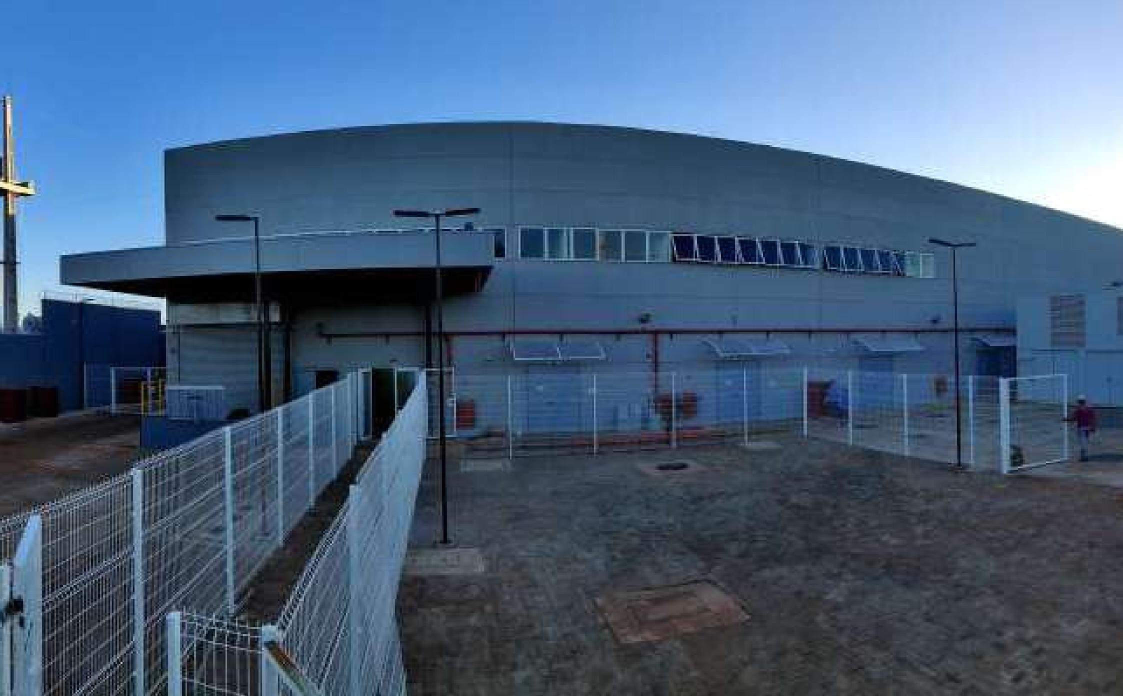
Data Center Paulinia 1