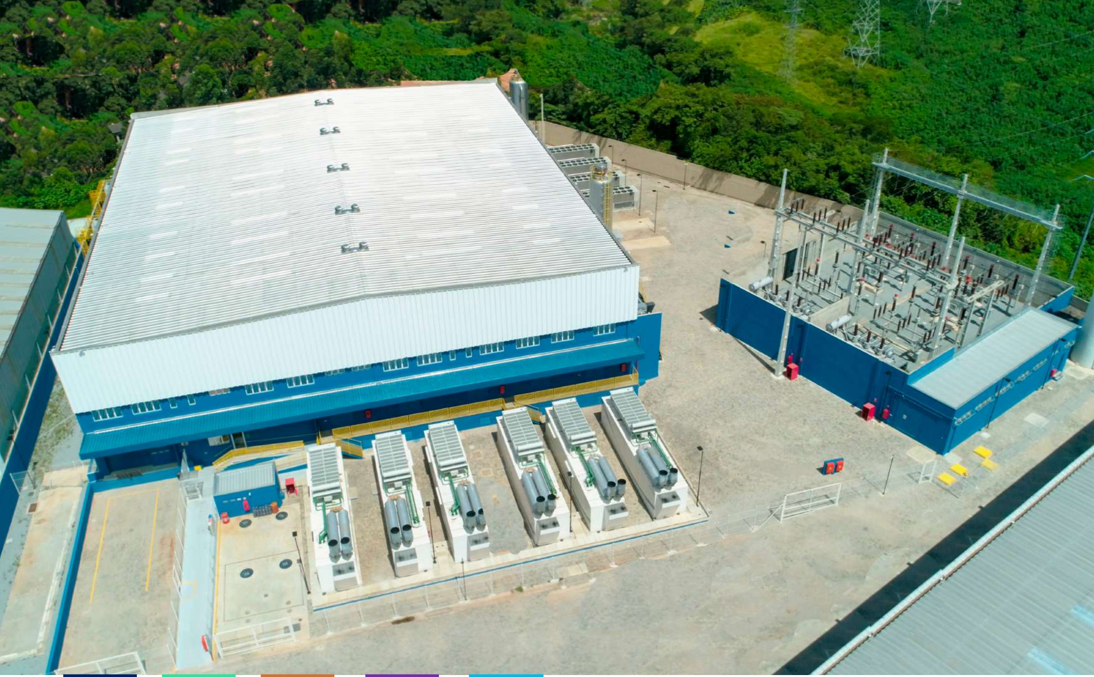
Data Center São Paulo 1