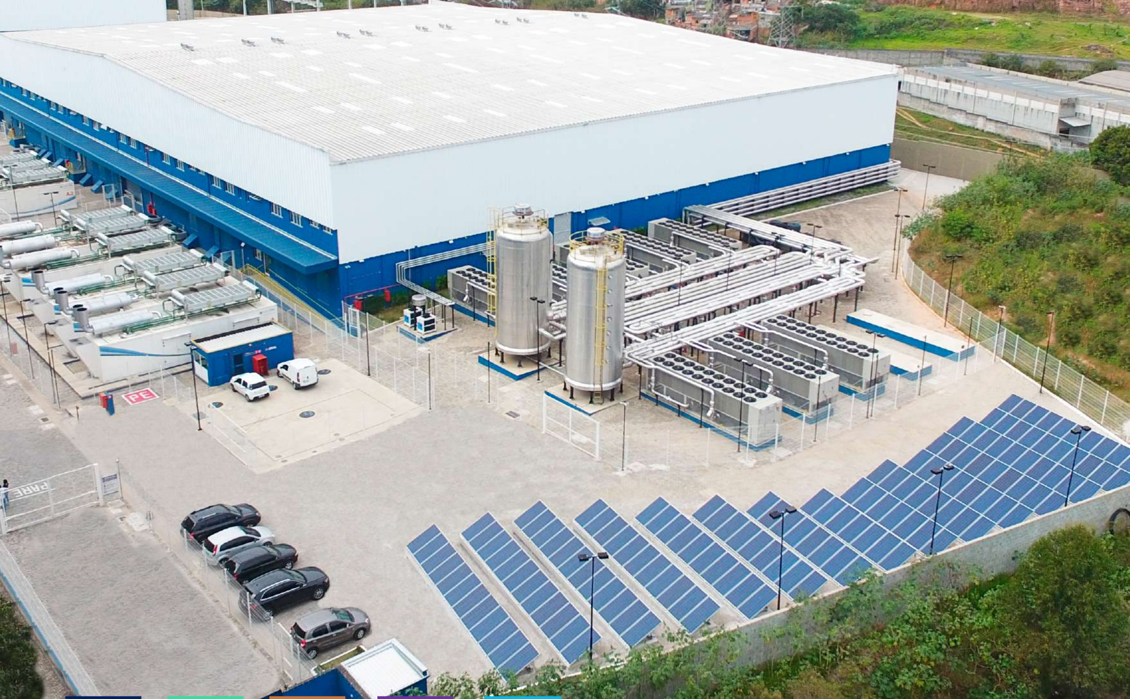
Data Center São Paulo 2